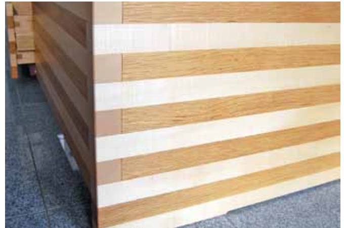
Precision work: The slats for the bed were made by the Cube and are ready for gluing

In view of the large number of current orders, he picked up the compact Cube himself and loaded it onto a trailer at WEINIG’s plant in Tauberbischofsheim. It took only 15 minutes for the first frame wood piece to be fed out of the Cube. A complex staircase in spruce was then completed on the Cube. Totally stable in dimensions, with exact right angles and in gluing quality” Werner Eichelbrönner recalls. “Insert the wood, enter the tool measures via the touch-screen, conform and away you got” is how the trained carpenter describes working with the Cube which has found a permanent position in the production process between format circular saws and spindle moulder.